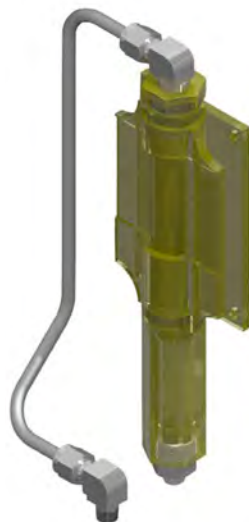
GTP-9739 Gammon Installation Kit