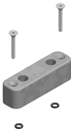
GTP-9782 Gammon Adapter